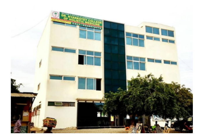
Fig. 2: Nyarkotey college of holistic medicine, ashaiman.

He took Naturopathy and holistic Medicine to a different level and established the first Naturopathic and Holistic Medical School, Nyarkotey College of Holistic Medicine, at Tema Community, 7, Post office and Ashaiman, behind the Municipal Assembly.<sup>25</sup>